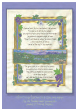
CONDOLENCE - PSALM 23