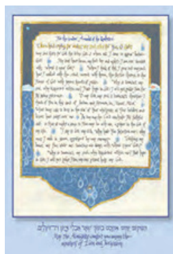
CONDOLENCE - PSALM 42