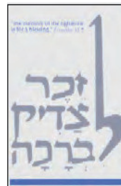
CONDOLENCE - WHITE