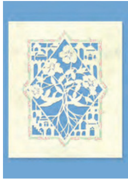
ALL PURPOSE - PAPER CUT