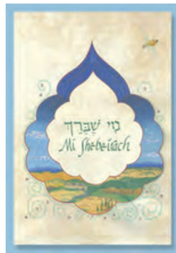
MI SHEBEIRACH - GET WELL