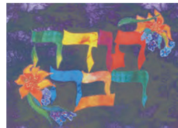
TODAH RABAH - THANK YOU